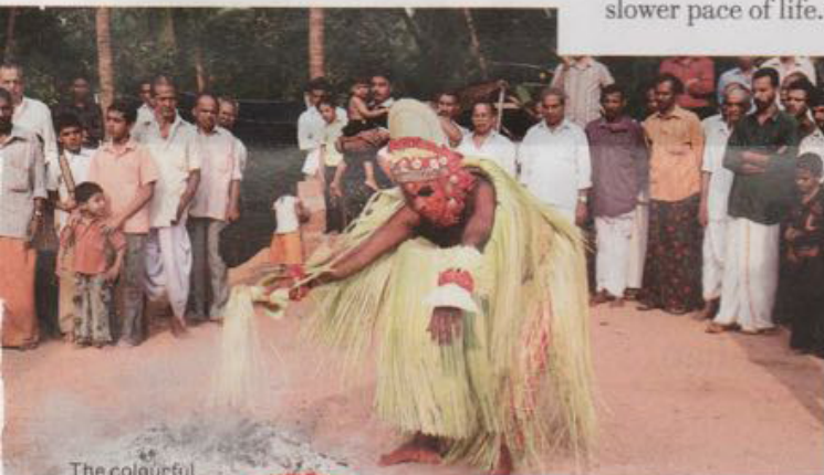
The colourful celebrations of the Theyyam

The Neeleshwar is purposefully tucked away; fortunately it has two restaurants, both offering local styles of food. The MEENAKSHI is the highlight and is situated on the beach. Instead of a menu, a chalkboard lists the seafood caught that day, cooked up with your choice of curry. Try the lobster with mango coconut curry, lemon rice and crispy parotta bread. ( neeleshwarhermitage.com )