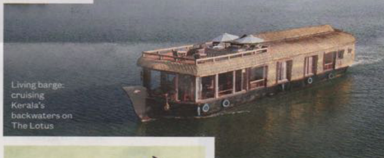
Living barge: cruising Kerala's backwaters on The Lotus