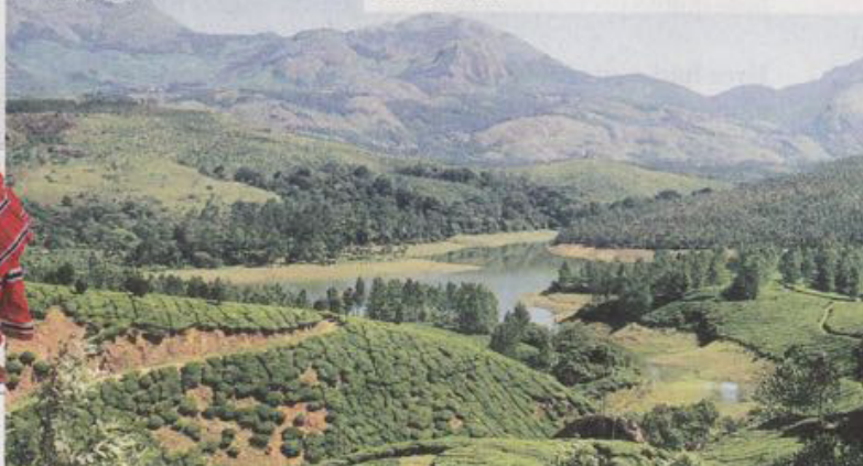
Run for the hills: the countryside of Ranipuram

The THEYYAM , a Hindu dance ritual popular in northern Kerala, includes a display of vibrant face paint and costumes, drumming, fireworks and men being repeatedly thrown onto hot coals. Tip: go before sunrise to avoid the heat. ( theyyamcalendar.com )